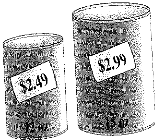
Figure for 8