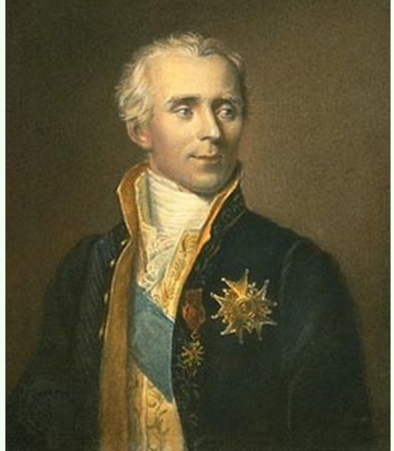
Pierre-Simon Laplace (1749-1827)